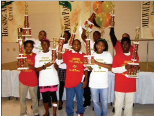
Housing Authority students flying high after winning in the HACM Spelling Bee